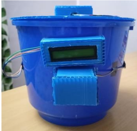
Figure 1: The Proposed Model

The major working components and connections of the Automated Water Quality Monitoring and Managing System are illustrated above. AT Mega acts as the main controller and brain of the system. Different sensors are used to sense different water parameters. The sensors include a temperature sensor to measure the temperature of the pond, a turbidity sensor to sense turbidity, a water level sensor to sense the water level, and a PH sensor to check whether the pond is acidic or basic in nature. Two solenoid valves are used to manage the acidic or basic nature, and the other water parameters are measured by the sensors and managed by the relay system.